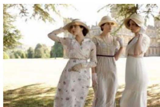
The costumes of