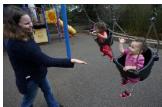
Does outdoor play