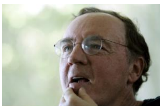
James Patterson is